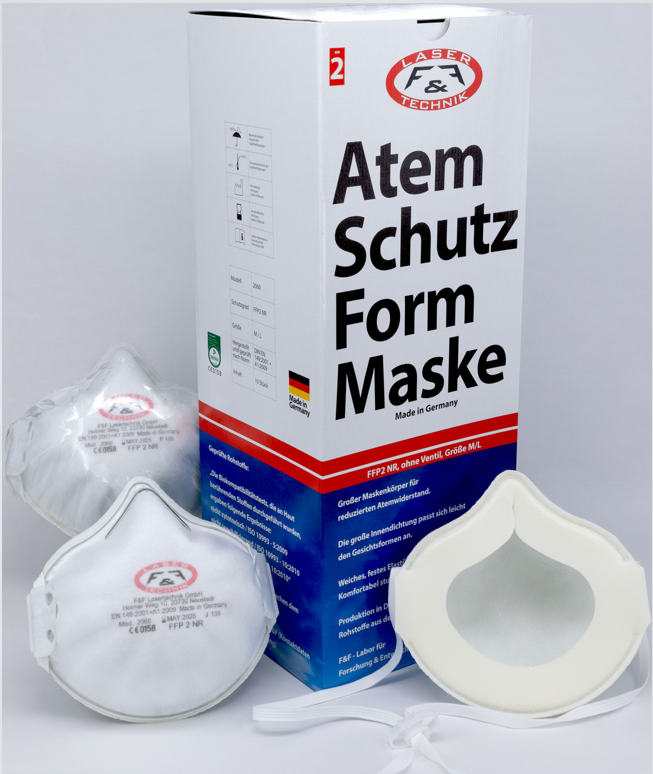
Cup Respirator Mask - 2060 FFP2 / 3060 FFP3* -