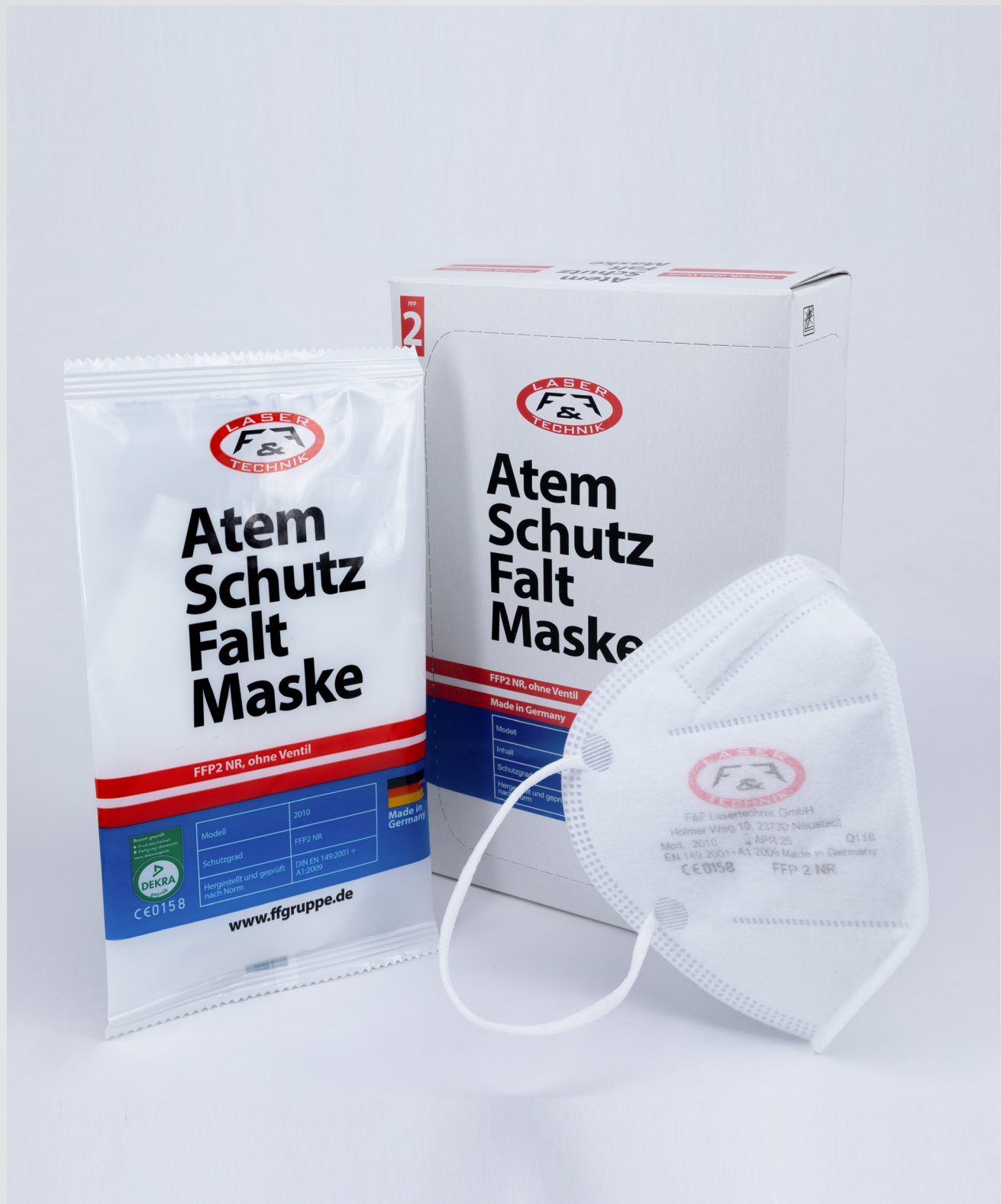
Folding Respirator Mask - 2010 FFP2 -